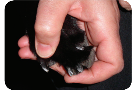
Figure 5: View of dark nails—chalky insensitive nail, dark, shiny quick

Whether the nail is dark or light, it is easy to distinguish between the insensitive nail and the sensitive finger tip. There is a white and chalky line around the quick—even easier to see on a dark nail than on a white one. (Figures 4 & 5) The quick is shiny and moist—it looks like living tissue. In most dogs, there is a clear demarcation between them. It is possible to significantly shorten the toenails, and get an immediate postural response in a single session. Nails need to be cut every other week to maintain their length. To shorten the quick, one must cut once a week. Some dogs tolerate a rotary grinder, like Pedi Paws, Oster Gentle Paws or a Dremel® tool better than clippers.