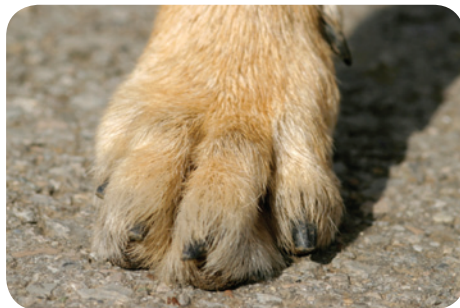
Figure 1: Normal toenails— toes well above ground

Unfortunately, our modern, man-made environments tend to alter the sensitivity of this feedback loop. Our dogs spend much of their time on slippery floors, abrasive concrete or pile carpet—all pretty unnatural surfaces! But dogs, as domestic animals, are highly adaptable. Most dogs with an intact nervous system can program a neural