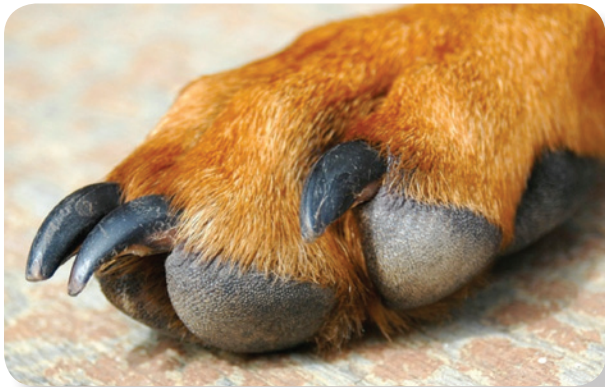
Figure 3: Abnormal toenails—claws below weight-bearing pad, pushing nail bed

We don't often appreciate how much dog toenails are like our own! If you look at your fingertip, you will see the hard, insensitive nail laid on top of the living finger. If, for instance, you filed the top of the "living" portion, it would not hurt, because there is a layer of keratin—a hard, horn-like substance—that protects the nail bed. A dog's nails are actually pretty similar. The tip of their finger is "the quick," which has sensitive nerves and blood vessels. When you "quick" a dog, making it bleed, you have essentially nipped off the end of their finger. No wonder they don't like it! But no dog ever died from a quicked toenail, so it is not the end of the world. With good technique, you can shorten even ghastly long toenails without ever making them bleed.