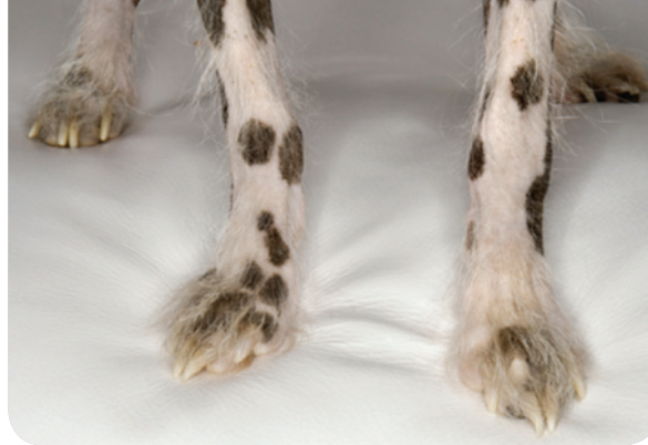
Figure 2: Grossly abnormal toenails resulting in abnormal posture— cramped in behind, base narrow in front, twisted toes, hyperextended

Unfortunately, our modern, man-made environments tend to alter the sensitivity of this feedback loop. Our dogs spend much of their time on slippery floors, abrasive concrete or pile carpet—all pretty unnatural surfaces! But dogs, as domestic animals, are highly adaptable. Most dogs with an intact nervous system can program a neural