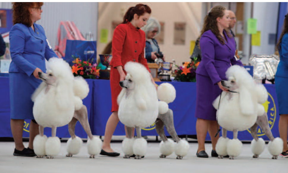
Handlers stack Standard Poodles during judging at the Poodle Club of America National Specialty in April at the Purina Event Center in Gray Summit, Missouri.