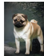
GCHP Hill Country's Let's Get Ready to Rumble