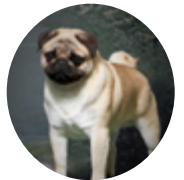
GCHP Hill Country's Let's Get Ready To Rumble