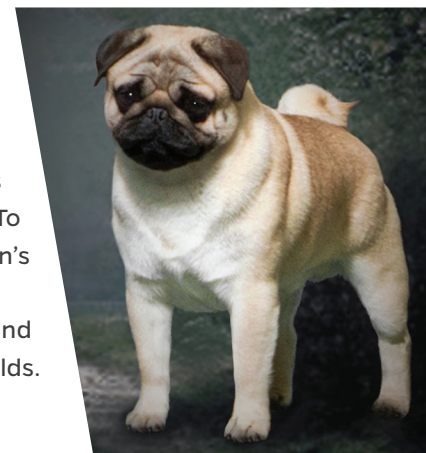
GCHP Hill Country's Let's Get Ready To Rumble