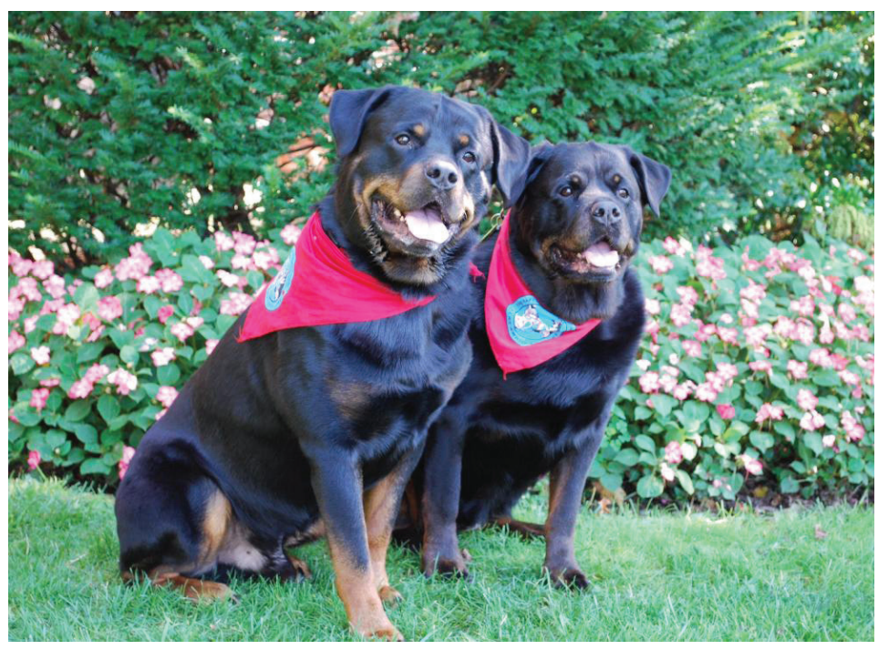
"Tedy," left, and his dam, "Lola," are pictured after a therapy dog visit. Both died of hemangiosarcoma. Tedy passed away at age 9, and Lola died at age 11.