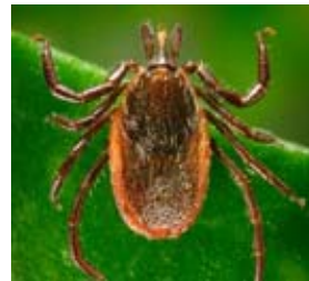
Western black-legged tick