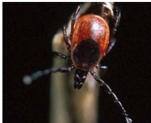
Blacklegged tick or Deer tick