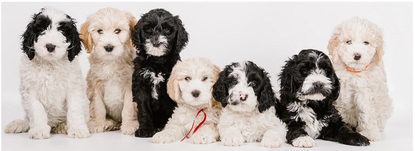
BARBET PUPPIES