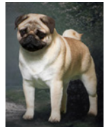
GCHP Hill Country's Let's Get Ready to Rumble