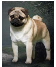
GCHP Hill Country's Let's Get Ready to Rumble